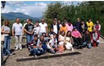
Visit of the students and the professors of the department of Social Work of the Evangelical University of Darmstadt.