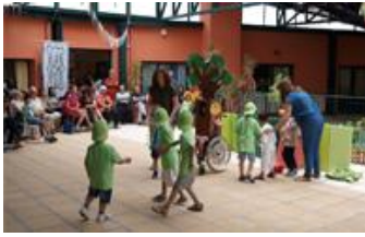
ELEPAP Summer Party