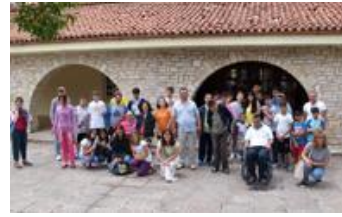
Excursion at the abbey of Vella